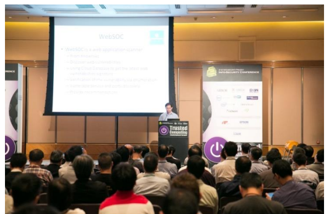
Breakout Session – Track B