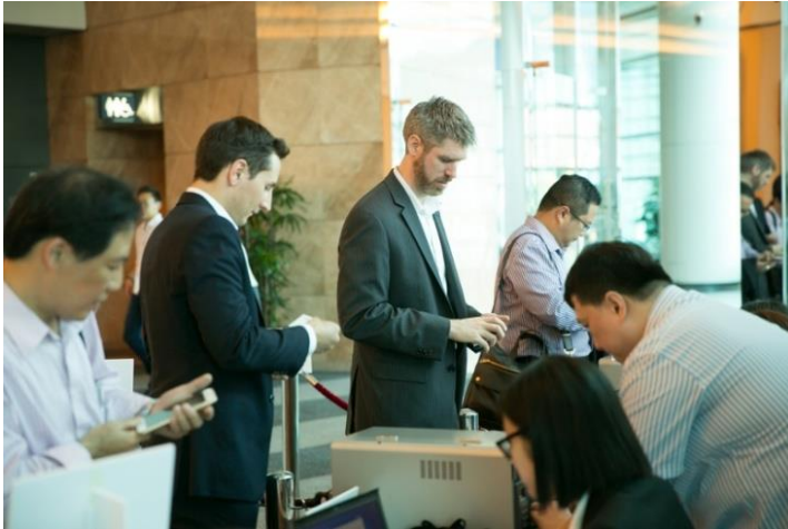
Attendees Presenting Barcodes for Registration