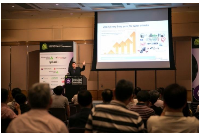
Breakout Session – Track A