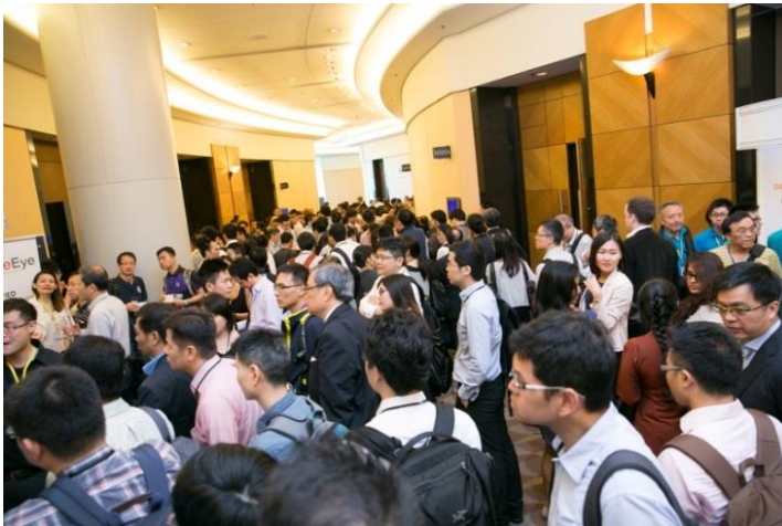
Outside the Conference Room