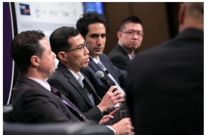
[Panel Discussion] The Debate: Is Trusted Computing to be Trusted?