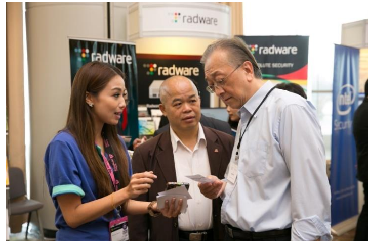
Exhibitor Interacting with Visitors