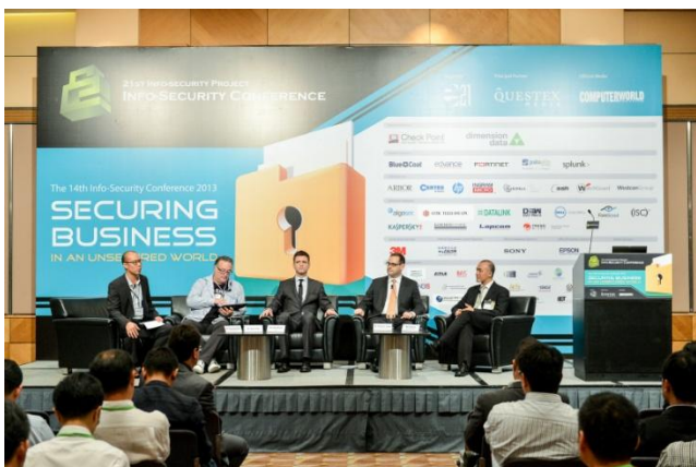
Panel Discussion: Are Asian Organizations Designed for Cloud Security?