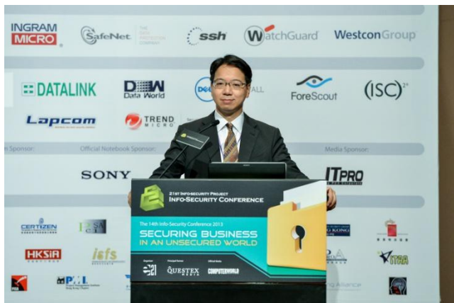
Welcome Remarks by Hon. Charles Mok, Legislative Councillor (IT) HKSAR