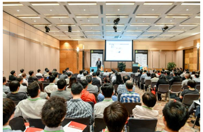
Breakout Session – Track B