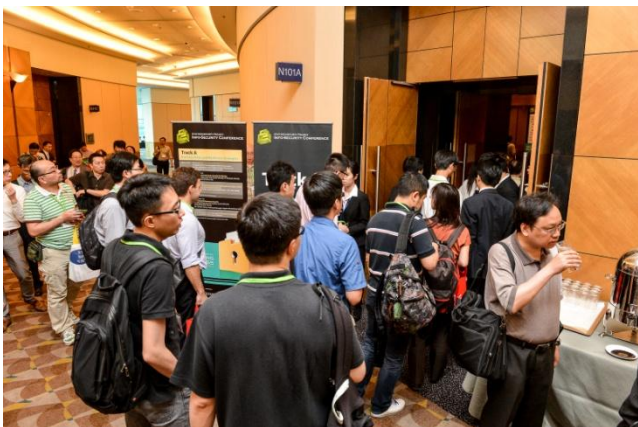
Breakout Session- Track A