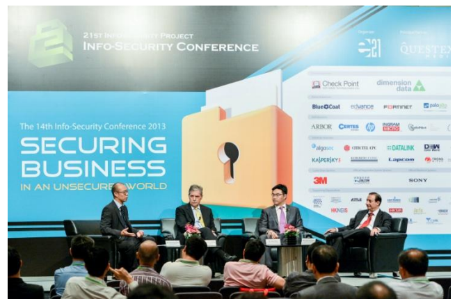
Panel Discussion: Top IT Security Concerns for 2013 - Where the Budget will and Should Go?